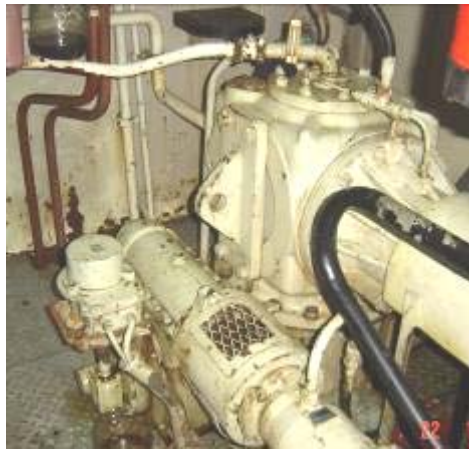
Sample tractor tug SRP 503/505