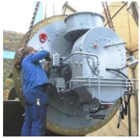
New SRP 1010